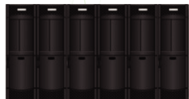
Kronicles Data Centre